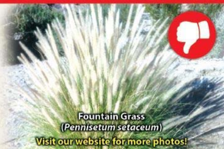
Fountain Grass ( Pennisetum setaceum ) Visit our website for more photos!